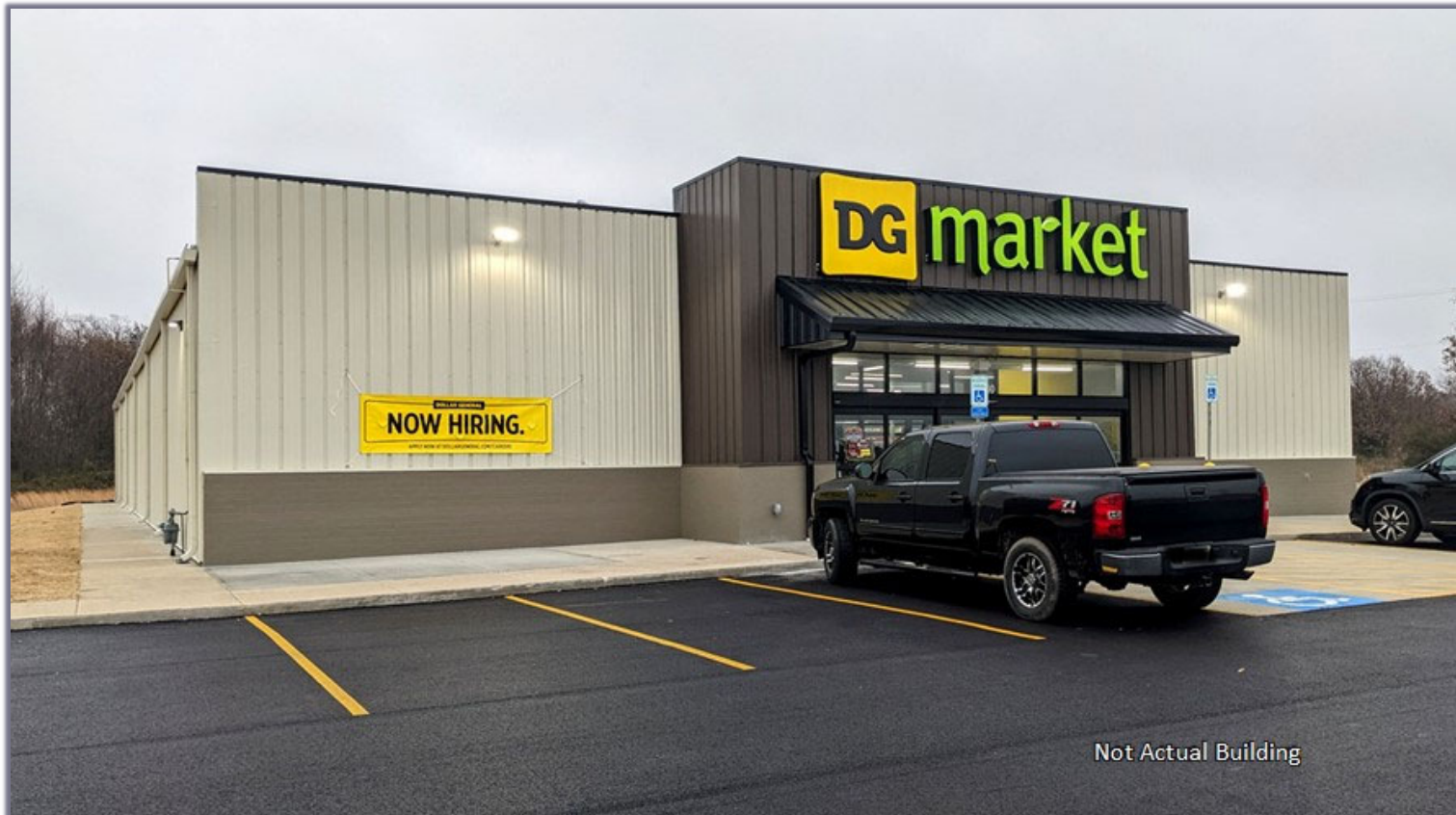
Not Actual Building